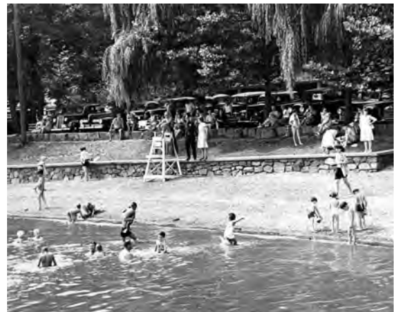
Once upon a time at Nyack Beach State Park