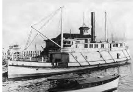
The Raleigh, the last freight steamer to stop at Nyack